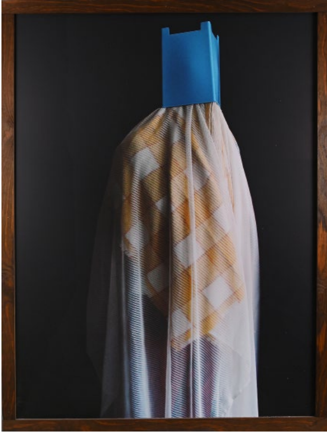
THORSTEN BRINKMANN, LOUIS ROYAL , 2008, 133 X 100 CM, PHOTOGRAPHY, WOODEN FRAMED, 1/5 + 2AP, COURTESY OF KUNST FÜR ANGELN E.V. © LENNART GRAU