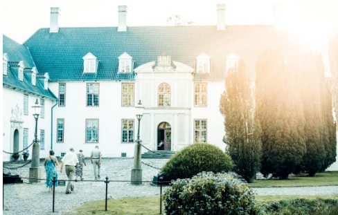
TOP: SCHACKENBORG SCHLOSS OUTSIDE VIEW, PHOTO: © ANDREJ GRILC DANISH CLARINET TRIOS & FOUNDER OF THE SCHACKENBORG MUSIC FESTIVAL, MARTIN QVIST HANSEN / PIANO, TOMMASO LONQUICH / CLARINET, JONATHAN SLAATTO / CELLO, PHOTO: © ANDREJ GRILC